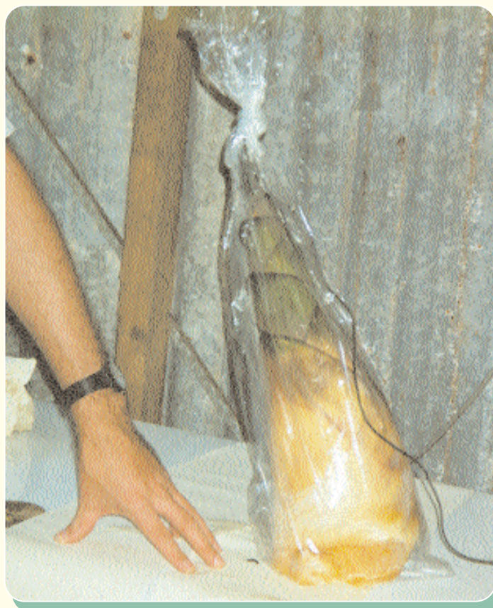
Preparing bamboo shoot for storage trial

Based upon our data on rates of transpiration (ie, the volume of water lost per unit area of leaf surface per unit time), and on the size of the canopy (the leaf bulk) of a mature plantation, we estimate that bamboo can use up to 3,300 mm per year under well-watered conditions. Current experiments are refining this estimation. This figure does not imply that for optimal shoot-timber yields such a quantity should be available, rather it indicates the maximal dissipation rate of a solid stand of bamboo.