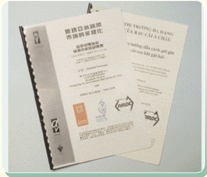
Handling notes in Cantonese & Vietnamese

A postharvest training course has been prepared for delivery to non-English speaking growers. By increasing the use of best