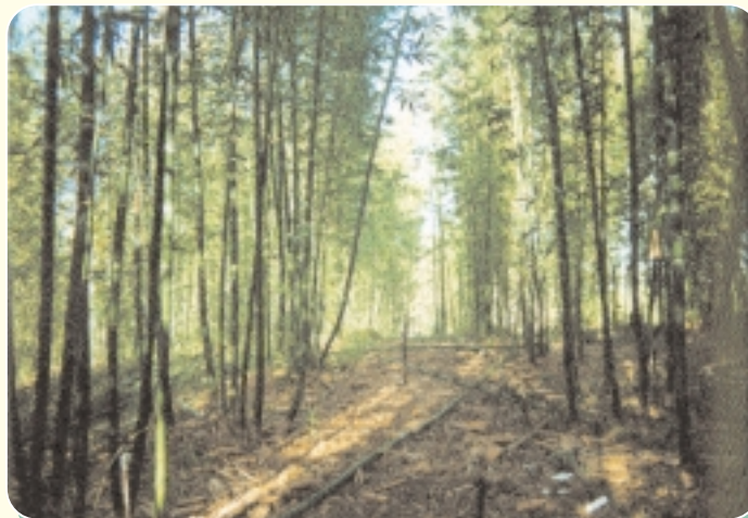
Near complete canopy of Bambusa oldhamii in South East Queensland

Commercial producers of bamboo for shoots and timber, and those growing bamboo for waste water dissipation, are seeking figures to help estimate best nutrient and irrigation requirements.